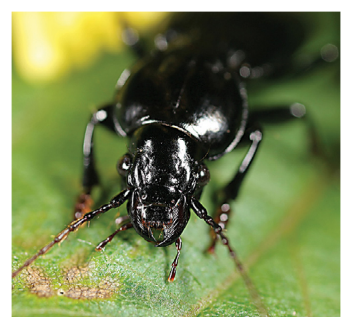
HARD WORKER. Carabid beetles, or predatory ground beetles, are one of the top consumers of weed seeds. They also have a large appetite for corn rootworms, with different species hunting them specifically during the day or night. The beetles typically thrive in environments where cover crops or non-invasive perennial margins are present.

A key term here is "trophic interaction" — how much a particular food that insects gravitate to and eat. The top 5 most frequent consumers of weed seeds are millipedes, small crickets, isopods, field crickets and carabid beetles.