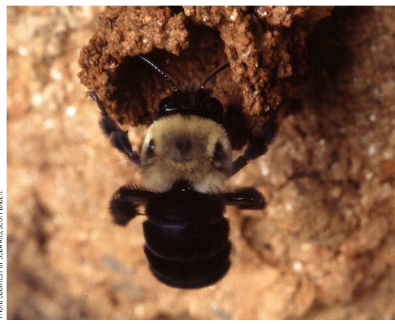
SOIL BUILDER. The mustached mud bee is an important beneficial insect that lives in the soil.

and promote a balanced system throughout by the use of cover crops, diverse rotations, livestock integration. All the five principles of soil health are going to promote a much more balanced insect community."