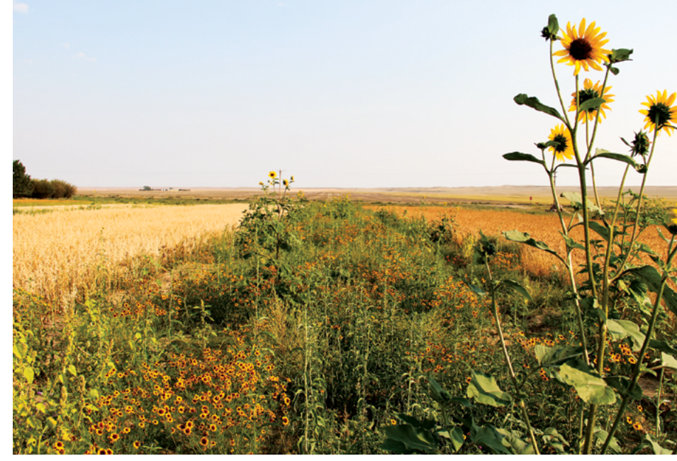
SCENTED STRIPS. In Montana, large producers of various small grains, including wheat, are using Xerces-designed seed mixes to create beneficial insect habitats.

"We've seen a staggering conversion of CRP land and grazing lands to commodity crop production in the wake of the renewable fuel standards