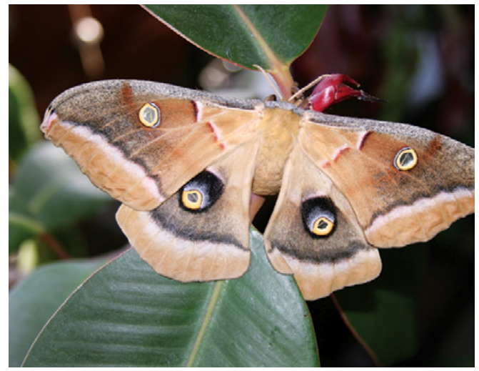
LOOK DEEPER. For every yield-robbing crop pest that no-tillers can name, there are more than 1,700 insects that are beneficial or neutral to farms, says USDA researcher Jonathan Lundgren.

One major role that beneficial insect communities play is as predators of harmful crop pests, such as corn rootworms and aphids.