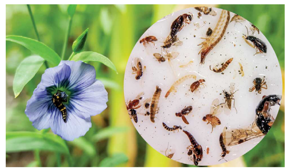
HUNDREDS OF SPECIES. Mike Bredeson's research evaluated the insect community when corn was at various growth stages and anthesis. Sampling revealed more than twice as many insects on the soil surface in the interseeded fields compared to corn monoculture fields — including everything from spiders and centipedes to beetles and flies.

Bredeson says the most innovative farmers are diversifying their farming ecosystems by varying crop rotation, adding pollinator strips, utilizing cover crops, growing multi-species mixes and integrating livestock.