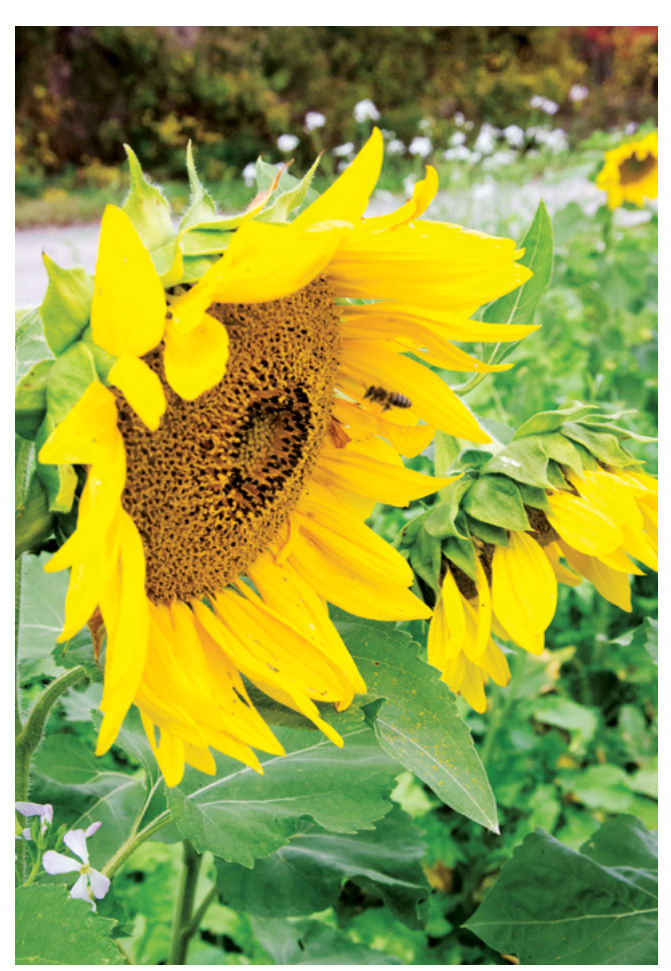
LATE BLOOMERS. Early- and late-blooming flowering plants in cover crops mixes not only enhance the nutrients and biomass available to future crops, but also "extend the bloom" for numerous pollinators.

Rollers tend to spool dung into small, marble shaped balls, roll them across the soil with their back legs and drop them into excavated underground storage pantries. The dwellers, as the name suggests, live right in